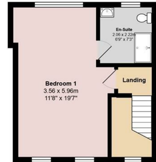
Second Floor Area: 32.0 m 2 ... 344 ft 2