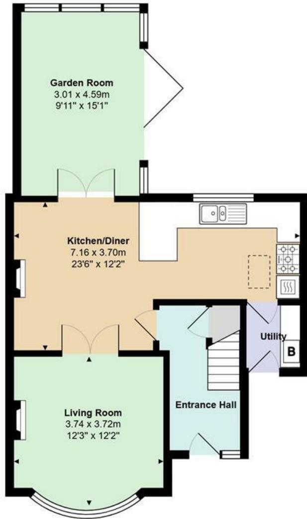
Ground Floor Area: 59.9 m 2 ... 645 ft 2